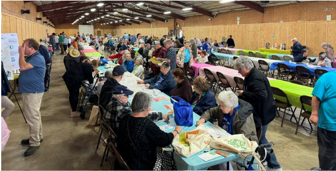
Older adults enjoying the 2024 Herkimer County Senior Picnic

A Publication of the Retired and Senior Volunteer Program and the Herkimer County Office for the Aging